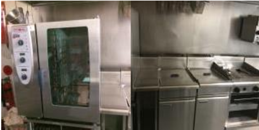
Café Combi Oven