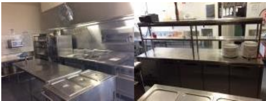
Café Kitchen left side