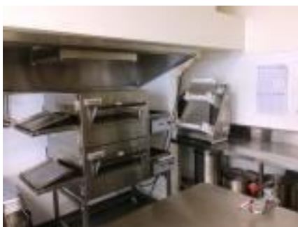
Pizza Oven and Dough Mix